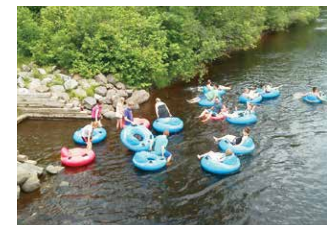
Tubing the Oxbow on the Pine River

The most popular tubing trip is on the Pine River Oxbow, but trips on the Brule River are enjoyable as well. The Oxbow is unique because it does not require a shuttle. The put-in and take-out locations are only ¼ mile apart so you can walk back to your car after your 2-3 hour float. The put-in is at the County N bridge over the Pine River 6 miles south of Florence. To tube the Brule River put in at the base of the Brule Dam and take out at Woods Road or for a shorter trip, take out on Camels Clearing Road. Brule Dam Rd is north of Florence. Tubes are available for rent locally as well as shuttle service for paddle or tube trips.